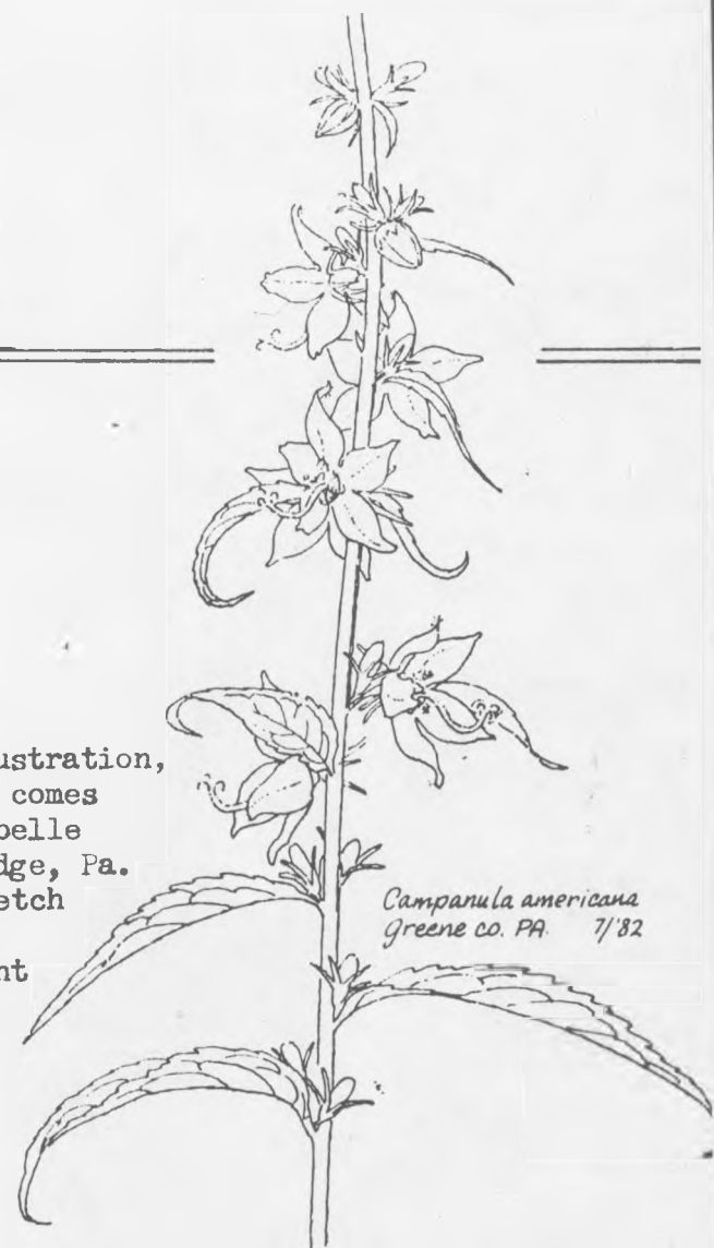
Campanula americana Greene co. PA. 7/82

This month's illustration, the tall bellflower, comes from our member, Arabelle Wheatley, of Wind Ridge, Pa. It is made from a sketch before coloring with watercolor. Excellent as it is in black and white, imagine how superb it must look in glorious color.