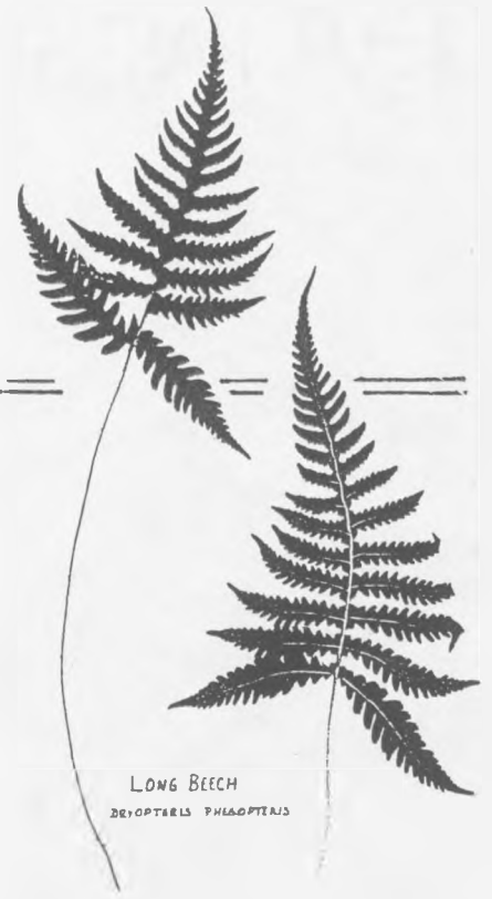
LONG BEECH DRYOPTERIS PHEGopteris