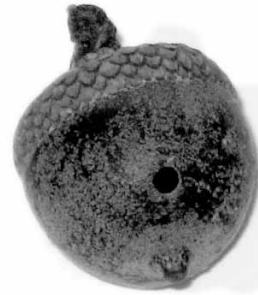
Pin oak acorn with weevil hole

Acorns are one of the most important sources of winter food for many species of western Pennsylvania wildlife. Chipmunks stash them in their burrows and feed on them during the cold months. Squirrels cache acorns, deer scratch for them and bears fatten up on them. Blue jays depend on acorns and migrating Wood ducks feast on the acorns of pin oaks that grow in wetlands. The muscular gizzard of the wild turkey can grind whole large nuts and common grackles have a ridge on their pallets that helps them crack open the shells.