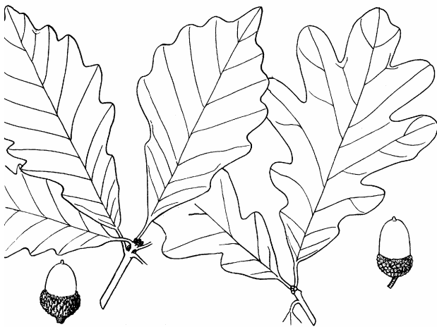
Swamp White Oak ( Quercus bicolor ) and White Oak ( Q. alba ) - Illustration from Flora of West Virginia , Part II, 1953 by P. D. Strasbaugh and Earl L. Core

White Oak ( Q. alba ) is the most esteemed of this noble family of trees; its wood, being compact, strong, tough and durable, is adapted to a greater variety of purposes than any of the other species. It is found throughout the State; but in the northern and western counties the wood is not so compact and tough as in the southeastern districts. This may be the effect of a difference of soil, or because the forests are thinner and the trees more widely separated from each other in the older settled counties. Even the best of our oak timber has not so close a grain as that of Europe.