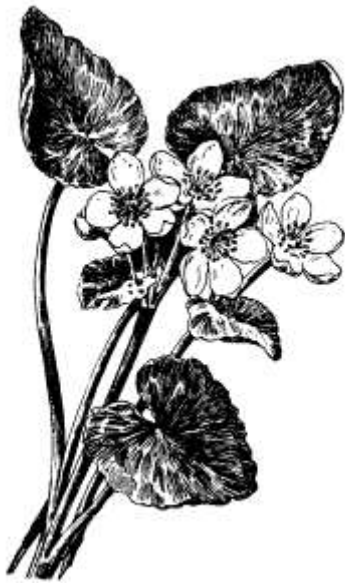
Caltha palustris – Marsh Marigold

In England there were about fifty other common names for Caltha palustris , some of which were shared with other plants. This is one reason botanical names are necessary. However, when new evidence about plant history and relationships requires it, the International Botanical Congress will change botanical names so that the names adhere to the rules of the International Code of Botanical Nomenclature.