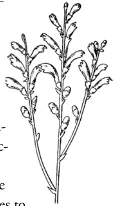
Beechdrops Epifagus virginiana Illustration courtesy of USDA-NRCS PLANTS Database

Hunt Institute is located on the campus of Carnegie Mellon University. The Institute is on the fifth floor of the Hunt Library, a 5-story aluminum and glass structure located on Frew Street and facing the "Cut" (the large grassy field in the center of campus). We will meet in the entrance lobby of the Hunt Library on Sunday at 2 p.m.